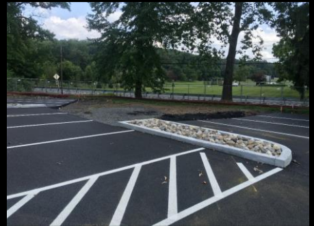
Parking Lot Design