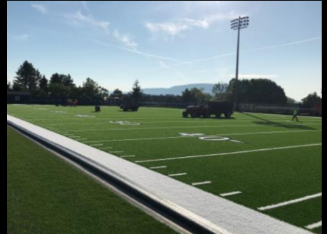
Turf & Field Site Upgrades