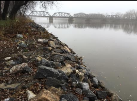
Stream Bank Remediation