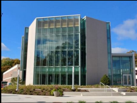
Building Addition Site Design