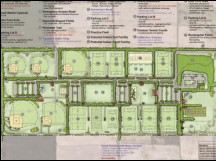
Park Design & Master Plan