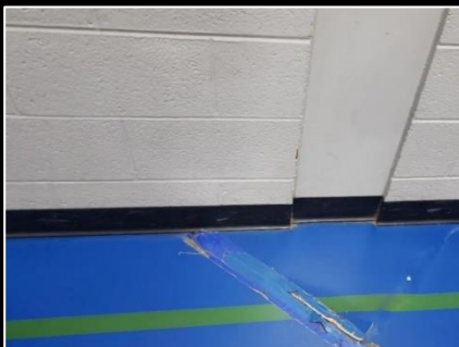
Floor finish damage resulting from differential slab settlement at column isolation joint as observed in the gymnasium