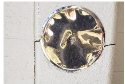
Typical vertical & horizontal cracking concrete masonry walls.