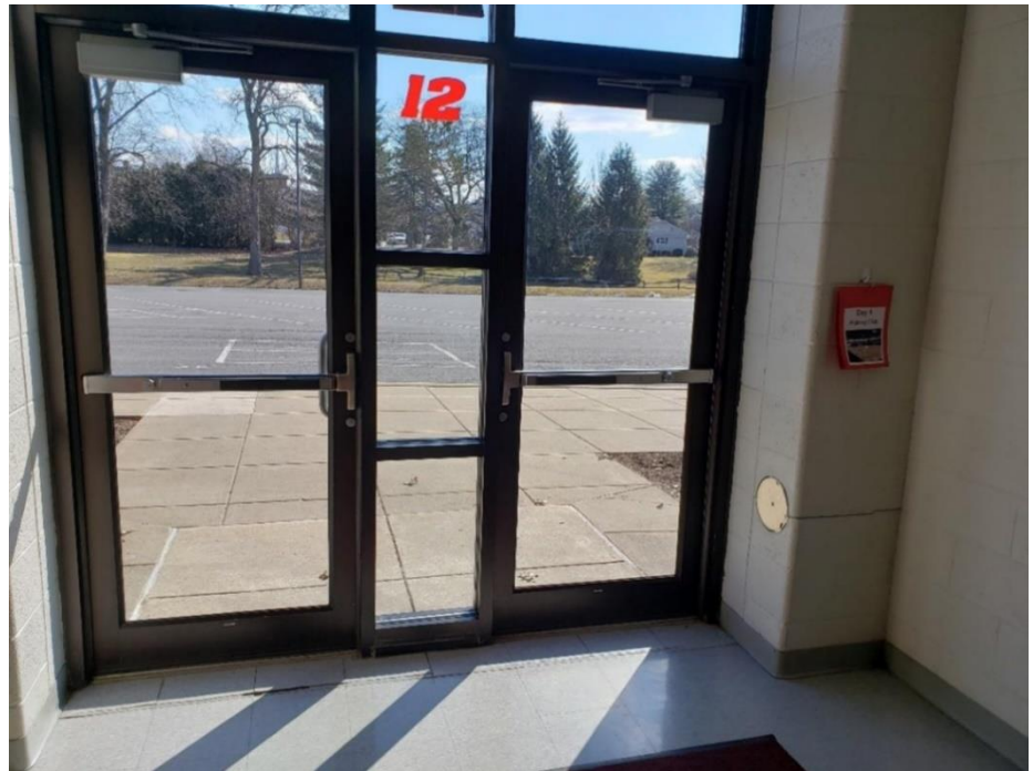
Masonry cracking & settlement of the slab-on-grade near the cafeteria